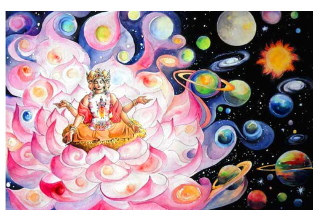
antaryAmi (thanks madhavapriya devidAsi)

"The wise and true seekers realize the Lord through meditation within their own self; they see Him vividly as the eye ranges over the sky".