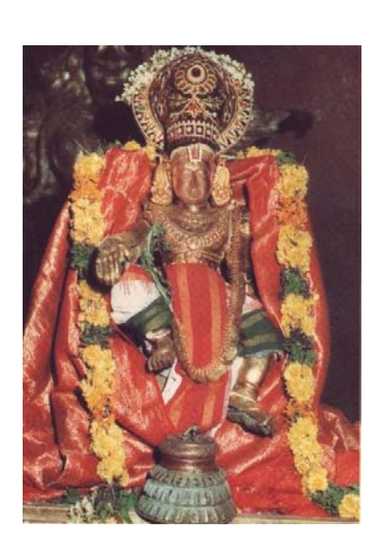
Lord MahA vishNu