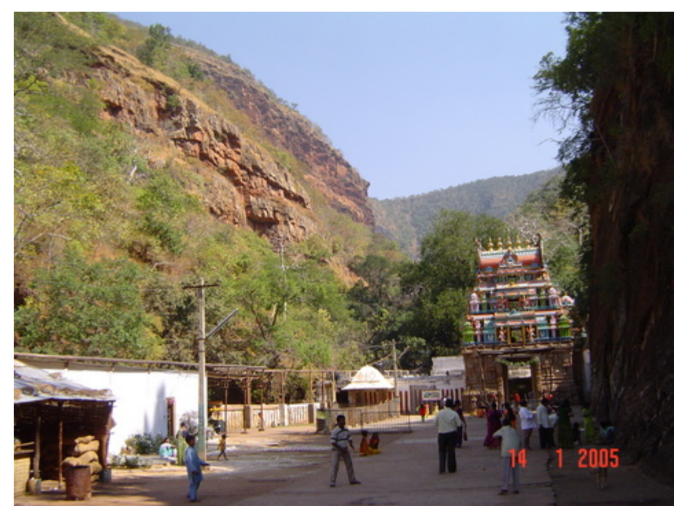
The Mountain Lion - Ugranarasimhar of Ahobilam

The all-pervading Thrivikraman dominates by His prowess like a powerful mountain lion. Within His three extended strides, all His creations rest (find their home). Just as an extraordinarily powerful lion strutting at the foot of the mountain jumps and reaches in a flash the top of the mountain, Our Lord extended His feet to measure the entire Universe. Every one who wishes to attain glory eulogizes the Lord in this way.